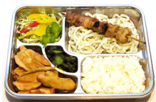
309 Teriyaki chicken breast