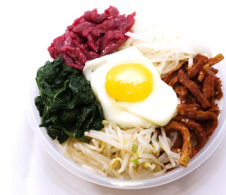
322 Beef Bibimbab