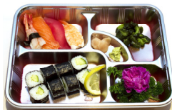
319 Sushi & Norimaki