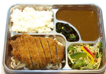
400 Curry Don Katsu