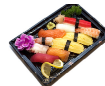
321 Sushi Deluxe