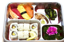
320 Sushi & California Roll